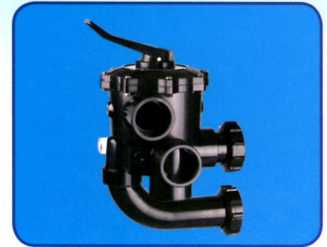
4- or 6-Position Multiport Valve